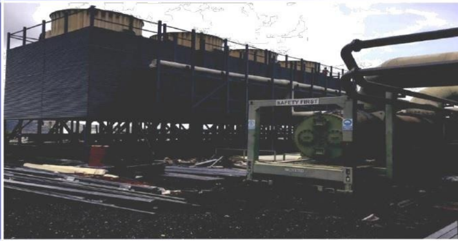
COOLING TOWERS AT KENGEN WELLHEAD 037, NAIVASHA