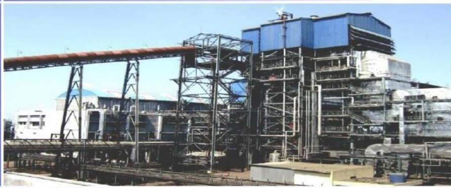
34 MW COGENERATION PLANT IN MUMIAS SUGAR COMPANY BY AVANT GARDE

We are a major Industrial suppliers and project consultants to the Power Generating Companies, Sugar Industries, Refineries, Cement Plants, Soda Ash industries, Ports Authority, Geothermal Plants and other major allied & consumer industrial sectors in this region. We have technical and local expertise for over 3 Decades in Kenya. These companies include: